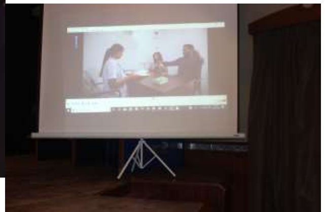
Short films showed during free time