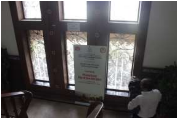
Nutritious food in a healthy (cotton) bag