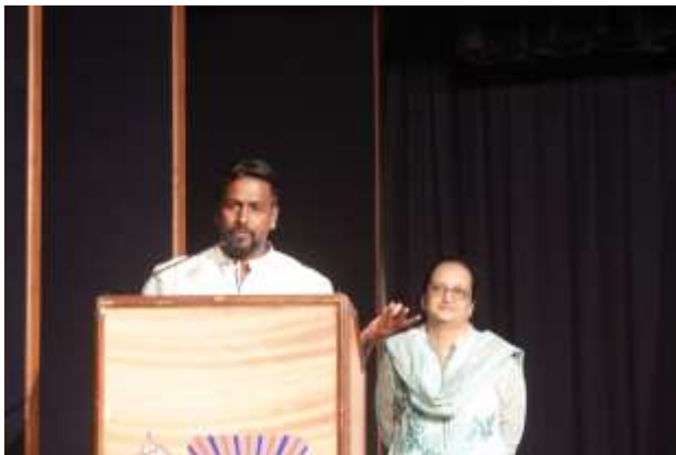
Address by Jury member