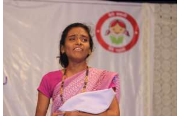
Nutritious food in a healthy(cotton) bag