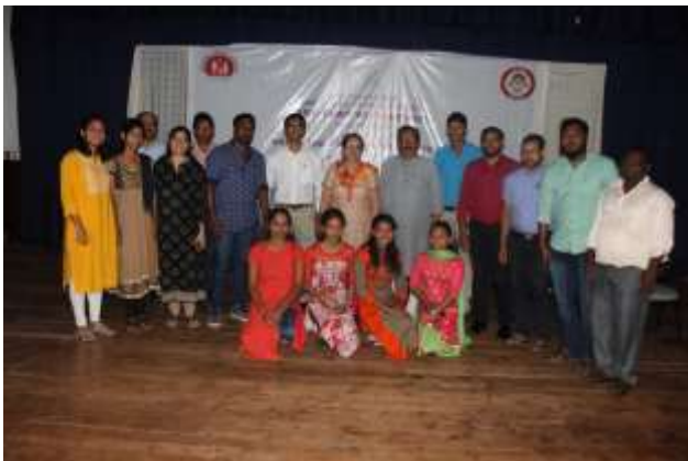
group photo of DIP staff