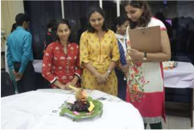
9 th October 2018-Bag Designing contest