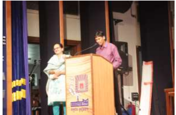
Compering & inaugural function