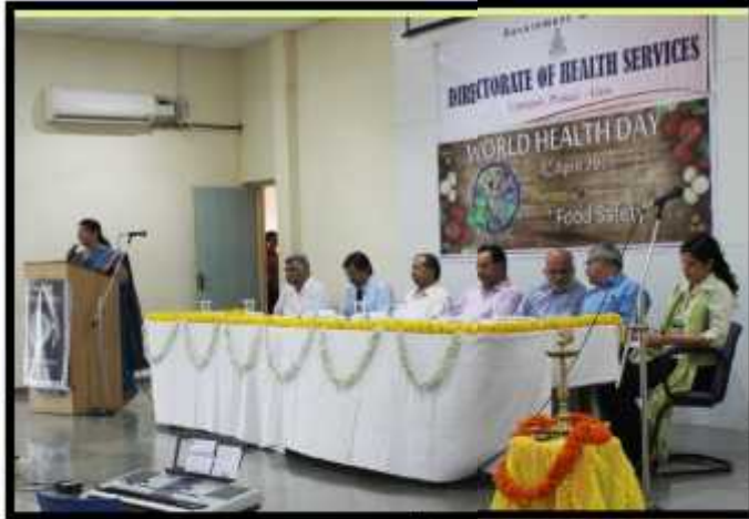
Welcome song by students of Institute of nursing Education, Bambolim