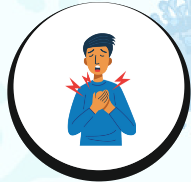
Difficulty in breathing

Then visit your nearest Government Health Centre/ Hospital